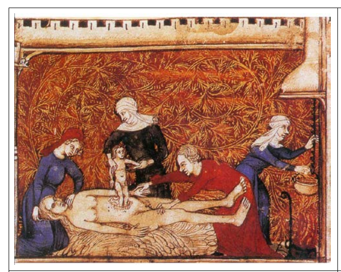
Figure 3 Faits des Romains fol. 197r: "Birth of Julius Caesar" 15th cent. Bibliotheque Nationale de Paris, ms. fr. 3576.