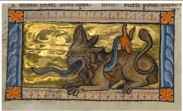
Figure 7 "A Crocodile and a Hydrus" Franco-Flemish ca. 1270 Tempera, gold leaf and ink on parchment. Leaf: 19.1 x 14.3 cm (7 1/2 x 5 5/8 in.) J. Paul Getty Museum, MS Ludwig XV 3, fol. 84v.