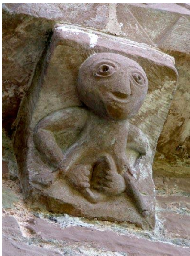
Figure 4 Sheela na-gig 12th century, English Stone Church at Kilpeck, Hertfordshire, England.